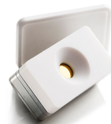
QSense Open module