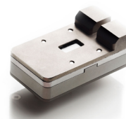
QSense Window module