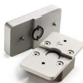
QSense Humidity module