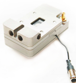
QSense Window Electrochemistry module