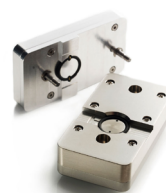
QSense Flow module