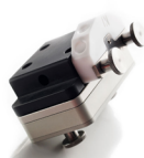
QSense Ellipsometry module